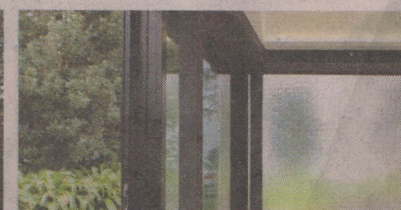
Studio and Garden Room – Peters House, Auckland Lynda Simmons – Architect