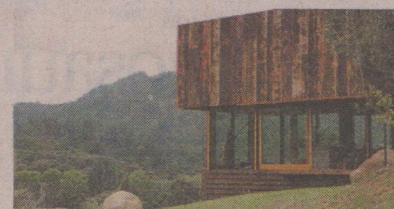
K Valley House, Thames Herbst Architects

Te Kura Kaupapa Māori o Ngāti Kahungununu o Te Wairoa RTA Studio