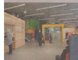
and Post House,