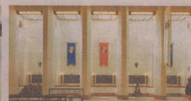
National War Memorial Projects, Wellington Studio of Pacific Architecture