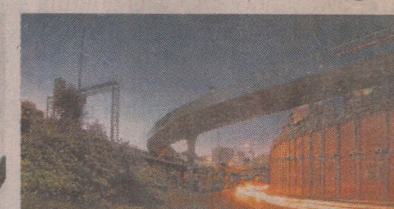
LightPath/Canada St Bridge Monk Mackenzie with GHD, Novare and LandLAB in association