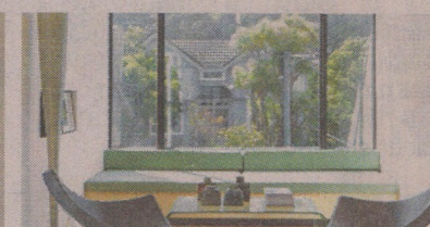
Zavos Corner Parsonson Architects