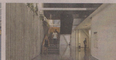
141 Cambridge Terrace/ Lane Neave, Christchurch Jasmax