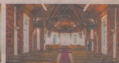
Toko Toru Tapu Church, Gisborne Architects 44